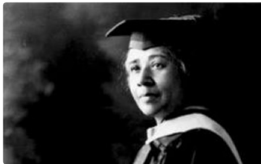
Anna Julia Cooper